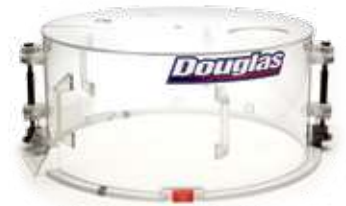
OEM components for manufacturers nationwide