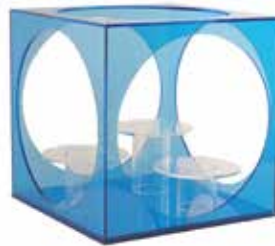
Retail displays at major department stores