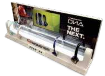
Custom visual merchandising for global consumer brands