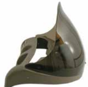
Windshields for boats, UTV/ATV, motorcycles and snowmobiles